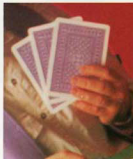
Illustrations: Nick Vainikauskis Props courtesy of Bazaar Novelty